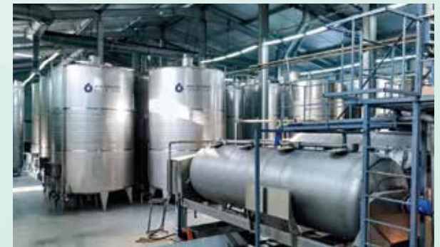
Water Treatment for Boilers