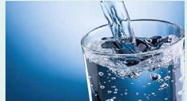
Disinfection of Potable Water