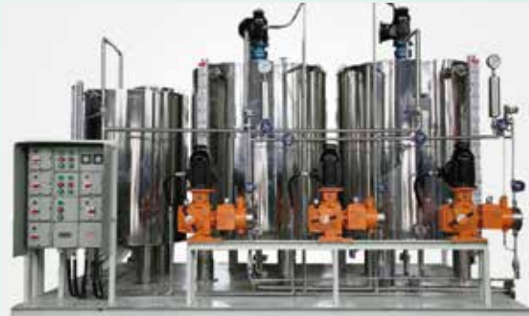
Chemical Dosing Systems