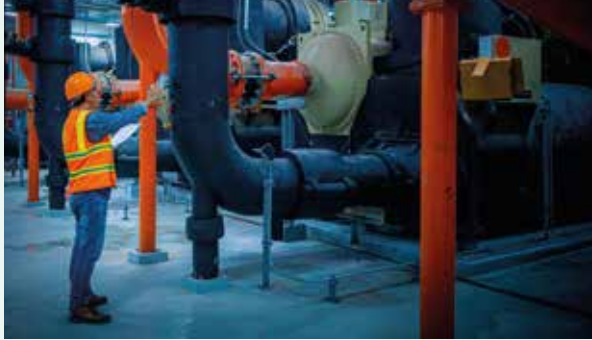
Water Treatment for HVAC System