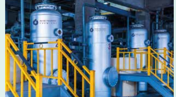
Water Treatment Chemicals