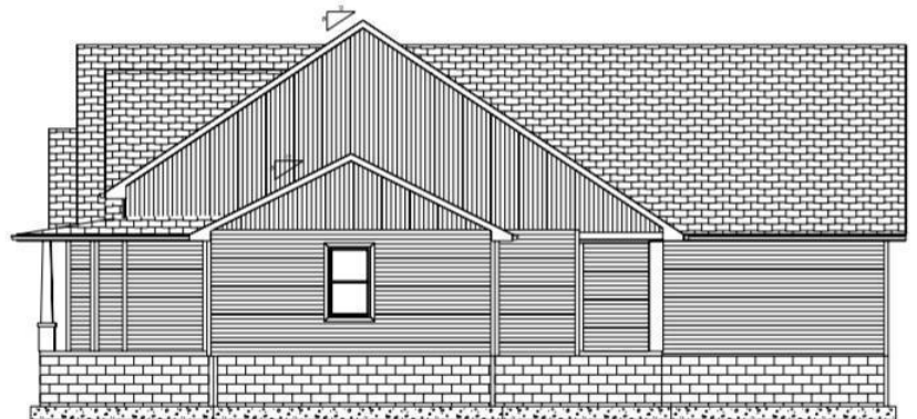
RIGHT ELEVATION SCALE: 1/4" = 1'-0"