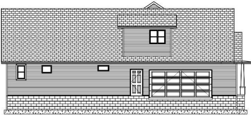
LEFT ELEVATION SCALE: 1/4" = 1'-0"