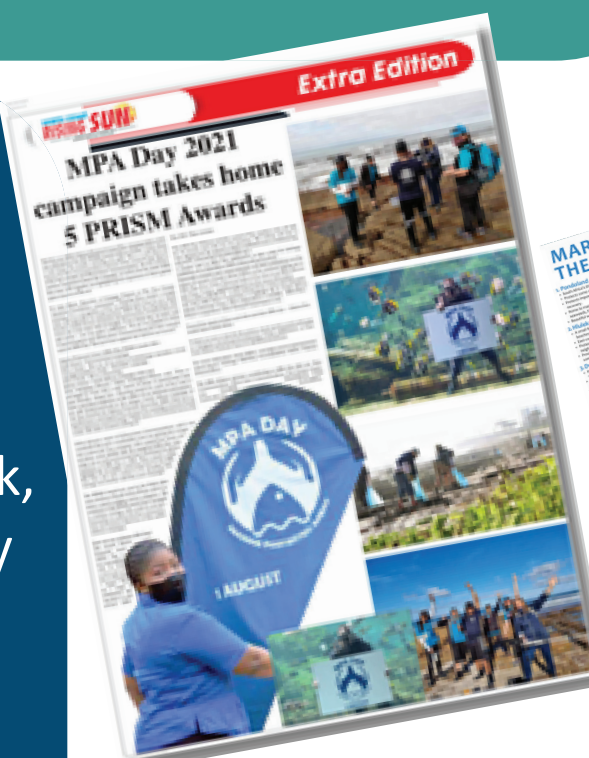
MPA Day received five awards, including one gold, at the 2022 PRISM Awards.