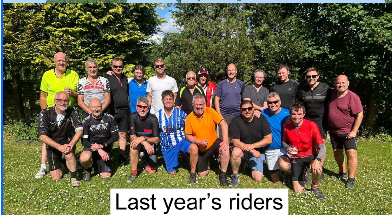
Last year's riders