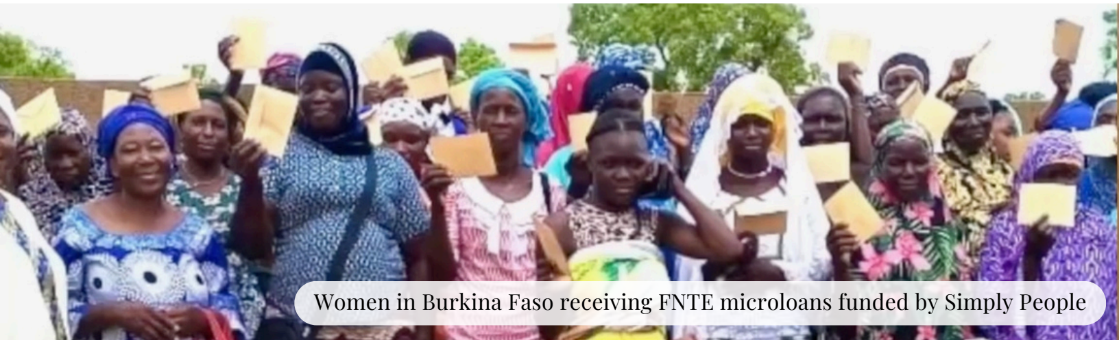
Women in Burkina Faso receiving FNTE microloans funded by Simply People

On December 3rd — the Tuesday following Black Friday —we are redefining what is normally known as Giving Tuesday. At Simply People it is Investing Tuesday; rather than making a donation, we will use your $100 investment to fund an FNTE microloan that will be paid forward each year. By the next Presidential election, your $100 investment will have radically changed four families in Africa.