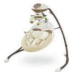
Nursing Pillow Play Mat Bouncy Seat Infant Swing