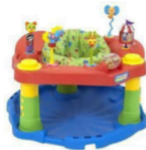
High Chair Stroller Car Seat/Booster Seats Exersaucer Activity Seats