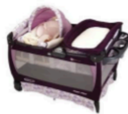
Crib or Toddler Mattress Changing Table Pad Pack 'n Play