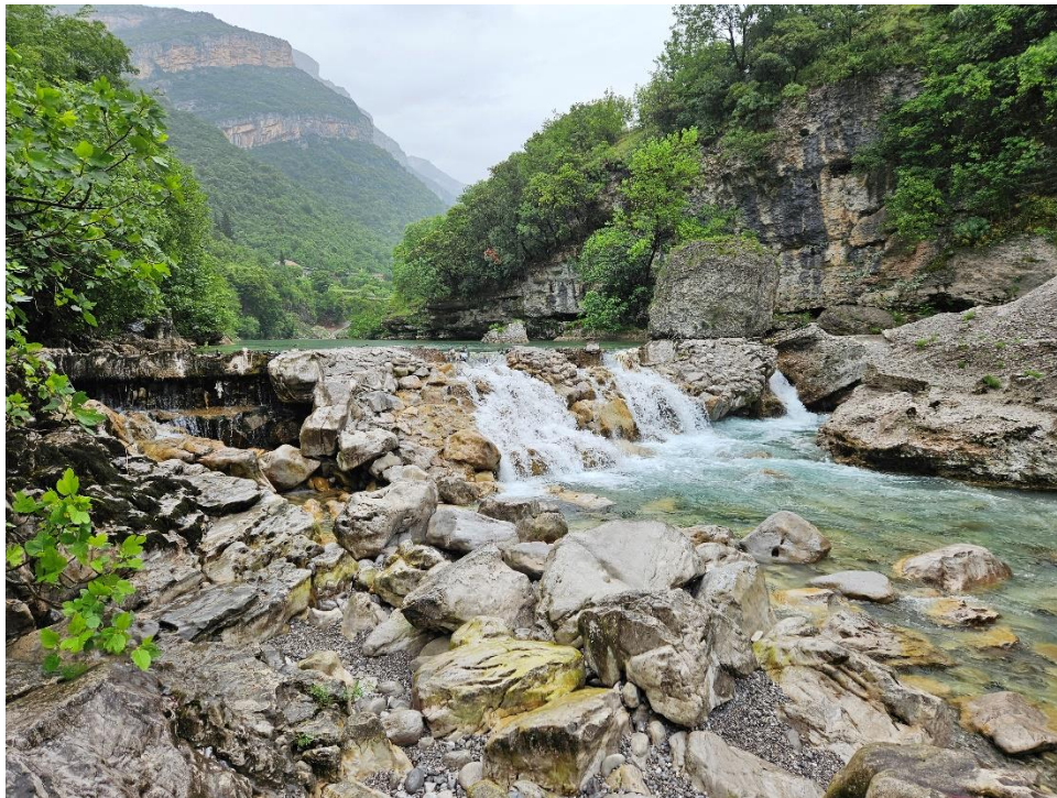
The barrier on the Cijevna river, Tuzi, April 2024