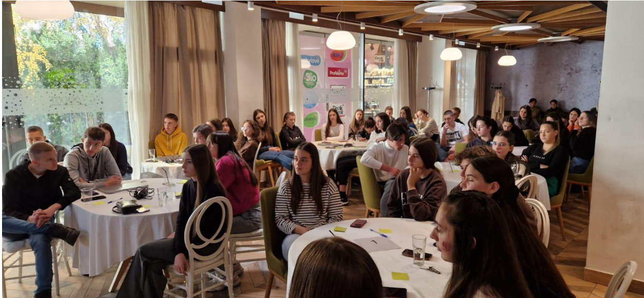
Hackathon "EcoGenius", Novembar 2024., Nikšić