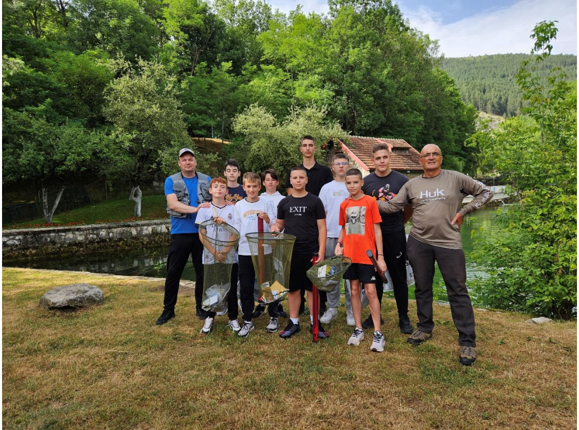
Fly-fishing school participants, Pljevlja, June 2024.