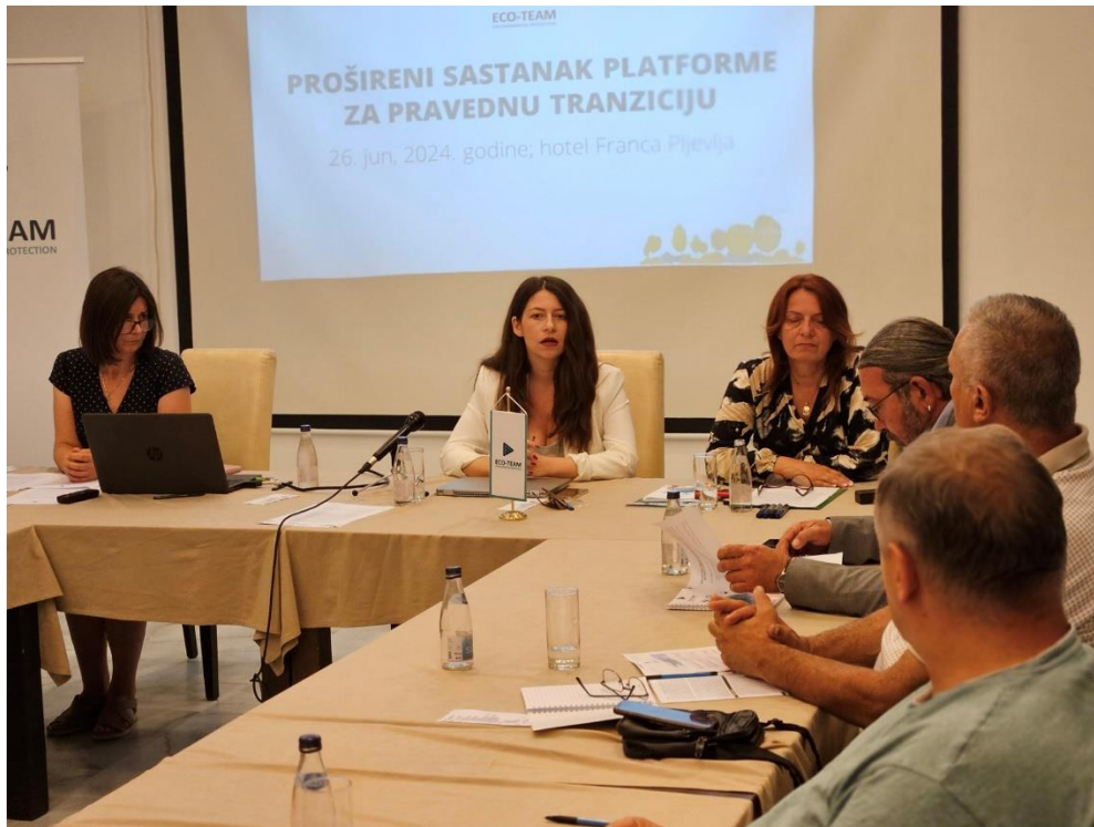
Meeting of the just transition platform, Pljevlja, June 2024.

challenges and ecological issues, highlighting the urgent need for the creation of a comprehensive Just transition plan.