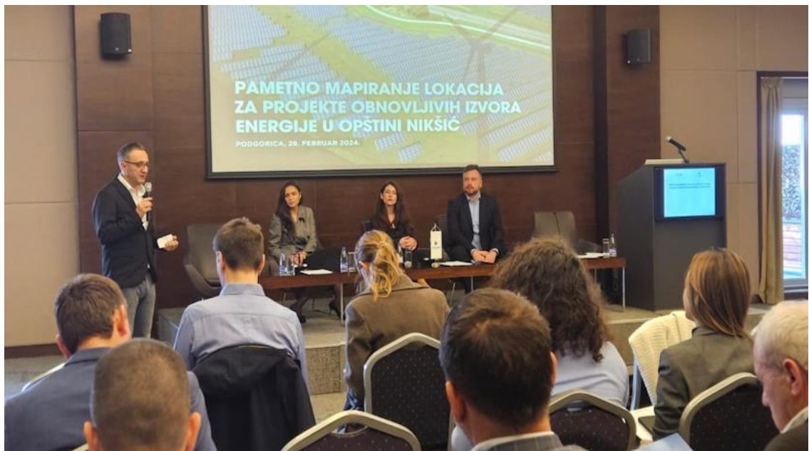
Panel discussion: "Presentation of the results of smart mapping of locations for renewable energy projects in the municipality of Nikšić", Podgorica, February 2024.