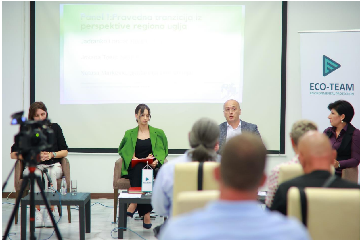
Conference "From vision to reality: Just transition of Pljevlja Municipality - What next?", Pljevlja, July 2024.