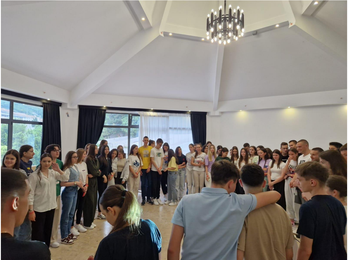
"Youth for a better future of Pljevlja"; May 2024., Čanj

aim of the event was to contribute to better cooperation and joint action among the youth of Pljevlja.