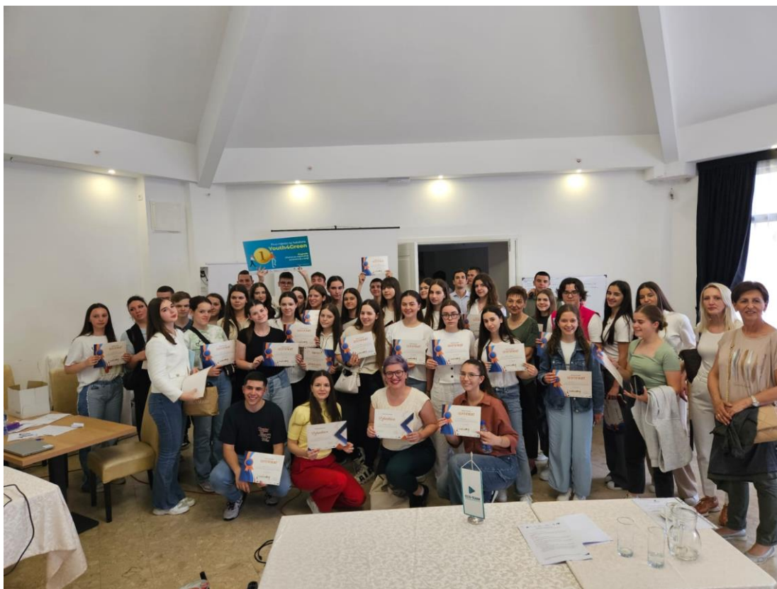
Hackathon „Youth4Green“, June 2024., Čanj