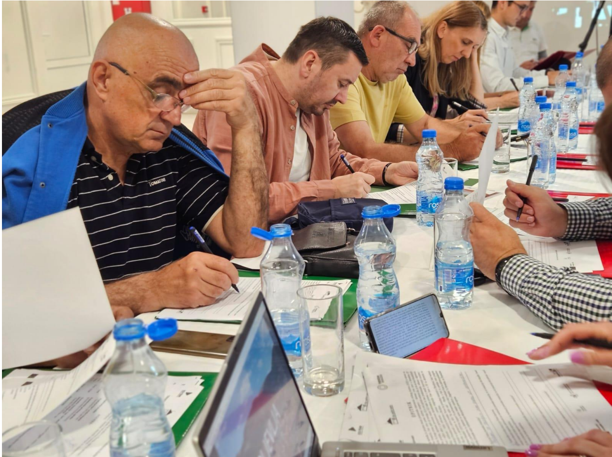
Training for representatives of civil society organizations from Pljevlja, Pljevlja, May 2024.