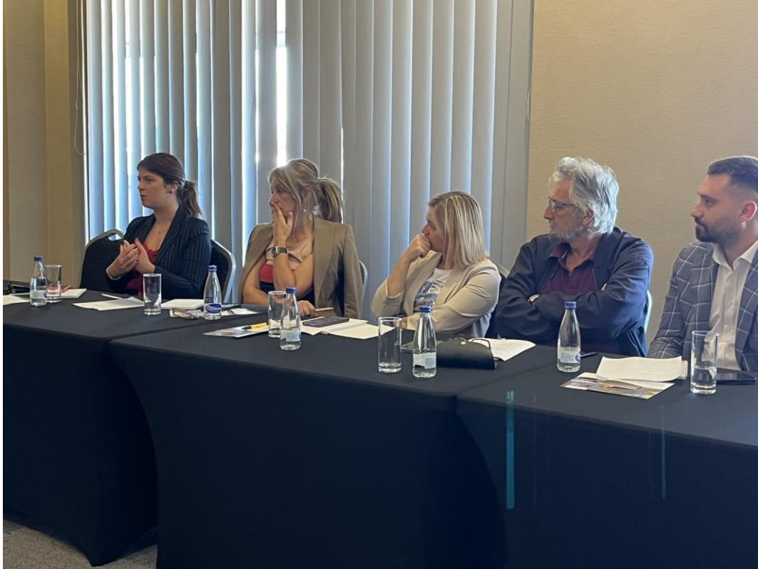
Workshop: "Sustainable approaches to peatland conservation and restoration in Montenegro: Understanding, development and collaboration", Podgorica, October 2024