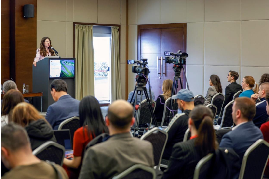
Conference: "Energy transition in Montenegro: Achievements, vision, and perspective of a sustainable energy future for Montenegro," Podgorica, March 2024.