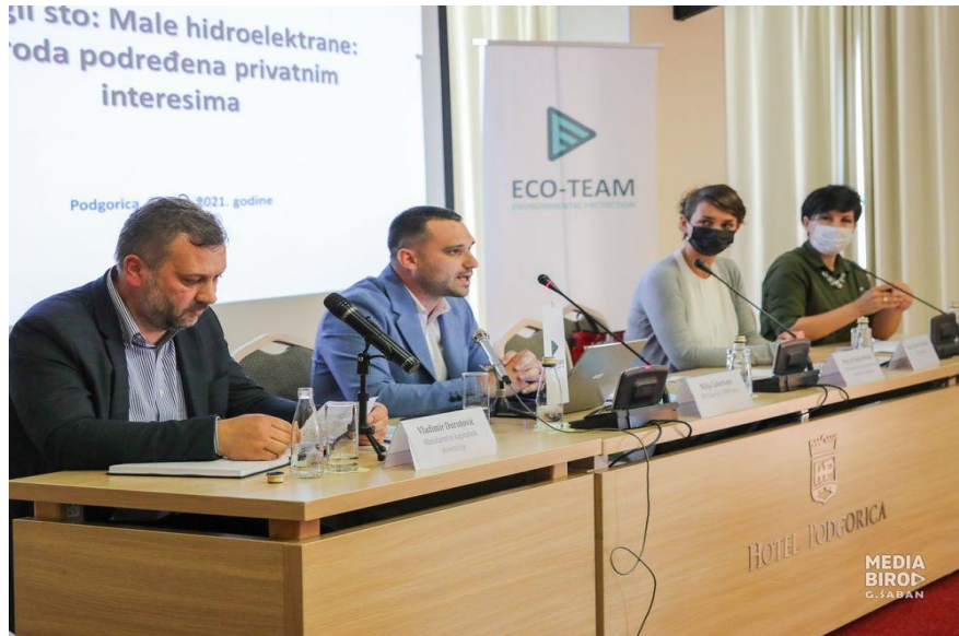
Round table "The small hydropower plants: the nature subordinated to the private interests", June 2021, Podgorica