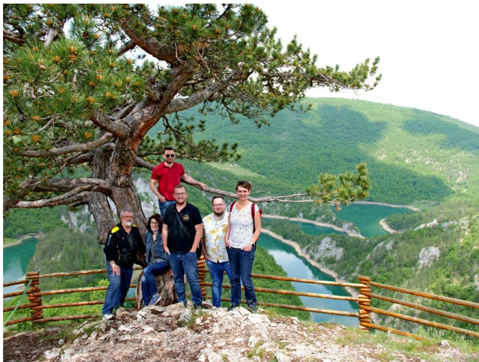
The meanders of the Čehotina River, Jun 2021, the municipality of Pljevlja