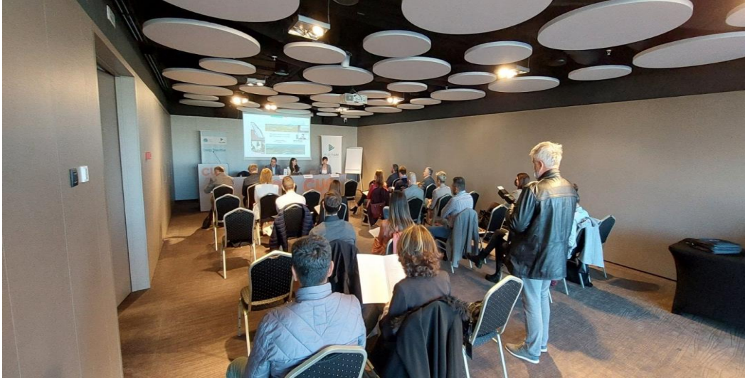
Round table: "The directions of the further development of the energy sector of Montenegro ", October 2021