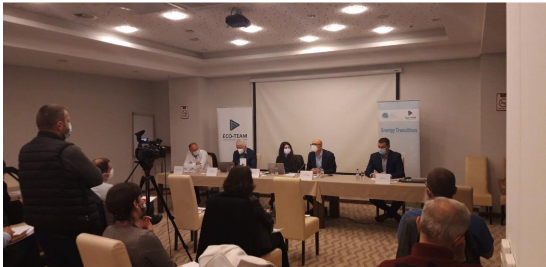
Meeting of the Platform for just transition, March 2021

organized. The meeting aim was to identify the key challenges and problems in process of the just transition planning as well as exchanging of the knowledge and experience on this topic among the local stakeholders;