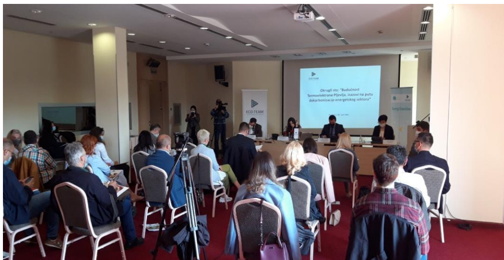
Round table: "The future of the TPP Pljevlja, the challenges on the path of decarbonization of the energy sector", April 2021