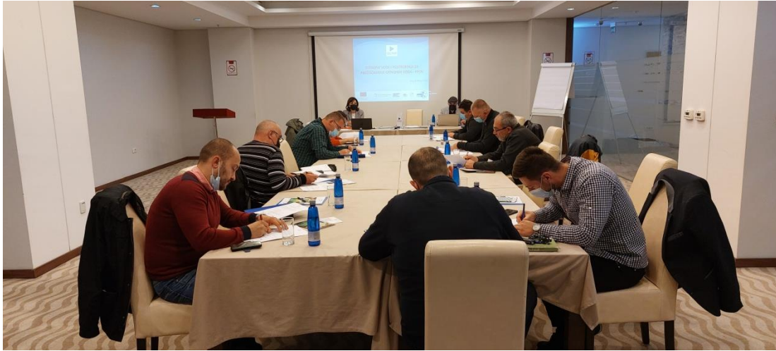
Training for the CSO, November 2021, Pljevlja