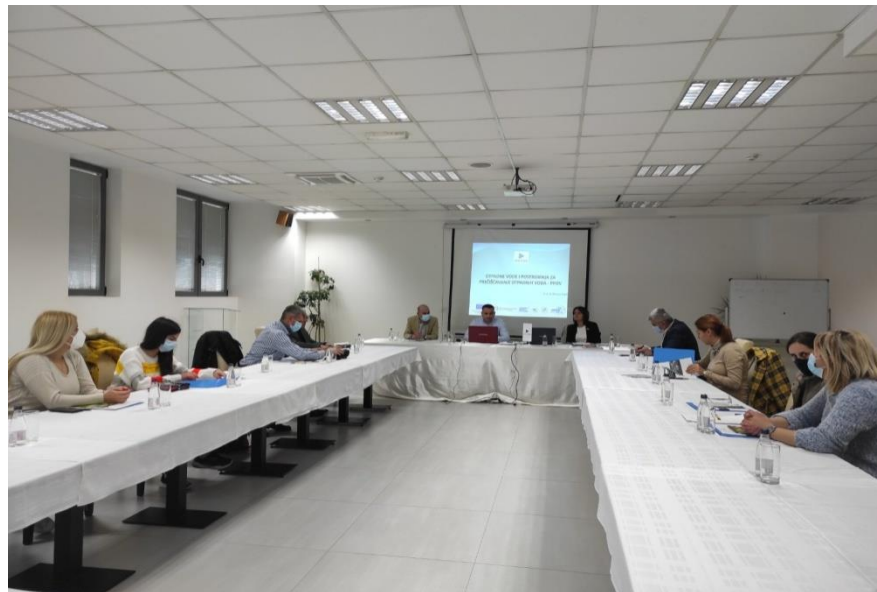
Training for the CSO, November 2021, BijeloPolje