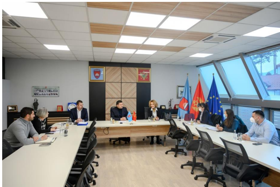
Meeting with the Mayor of the Municipality of Bijelo Polje, November 2021, Bijelo Polje