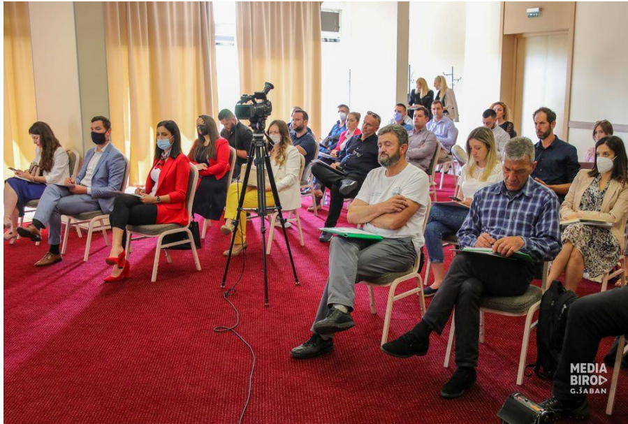
Round table “The small hydropower plants: the nature subordinated to the private interests”, June 2021, Podgorica