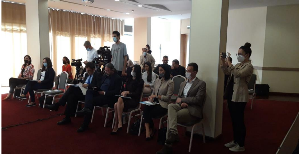
National conference of the Just transition, September 2021.