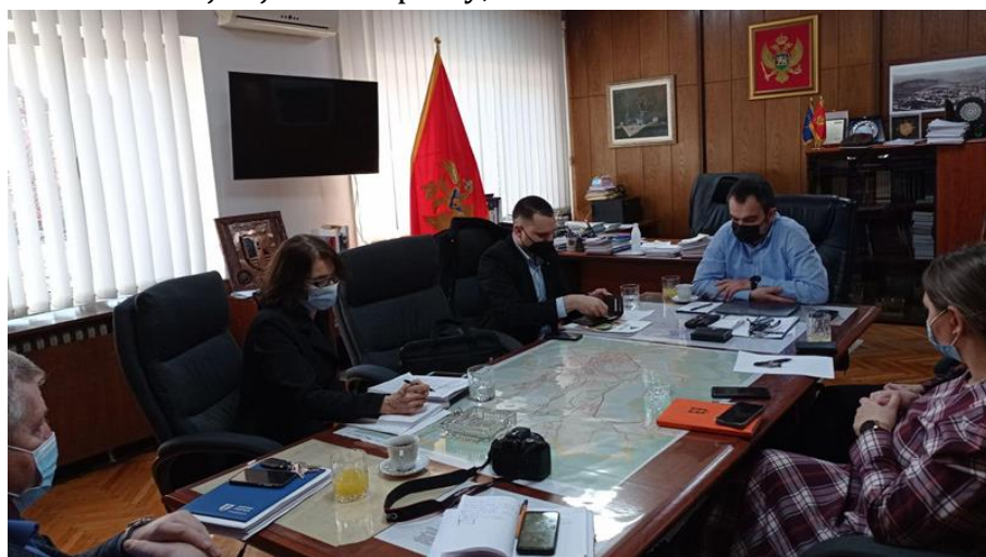
Meeting with the Major of the Municipality of Pljevlja, February 2021, Pljevlja