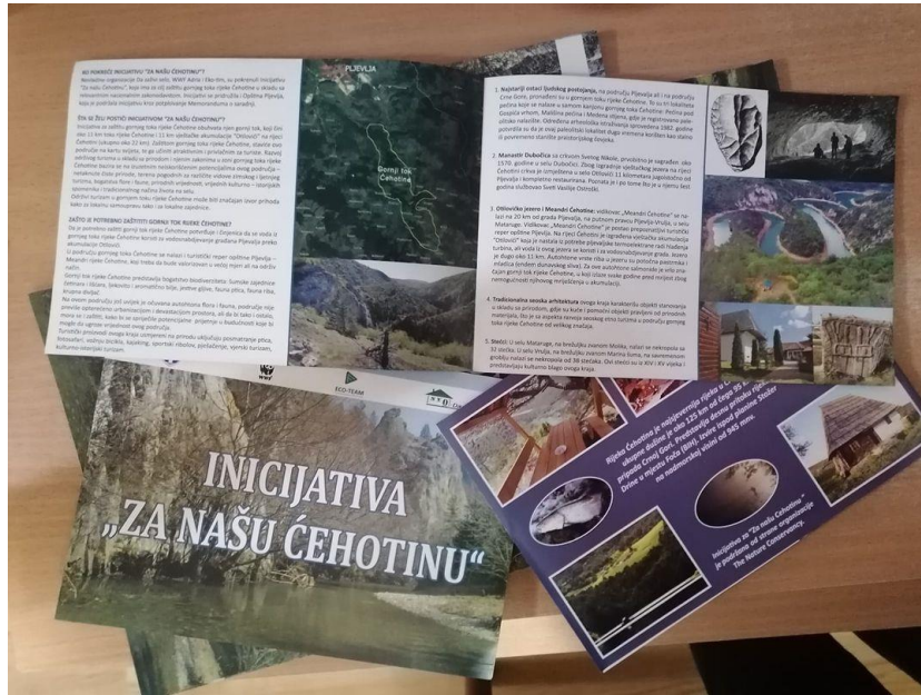
The brochure of the values of the upper part of the Čehotina river