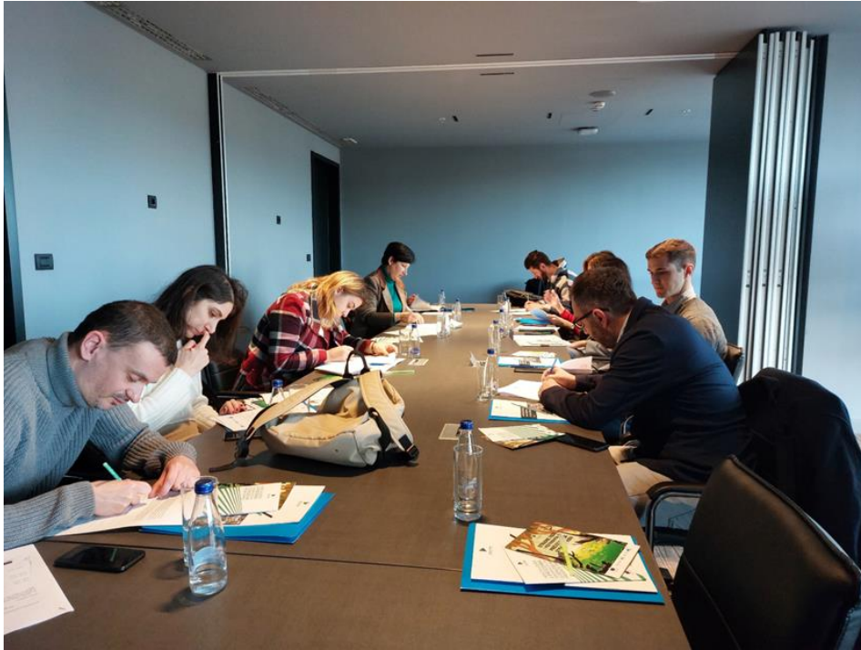
Media training, Podgorica, February 2022