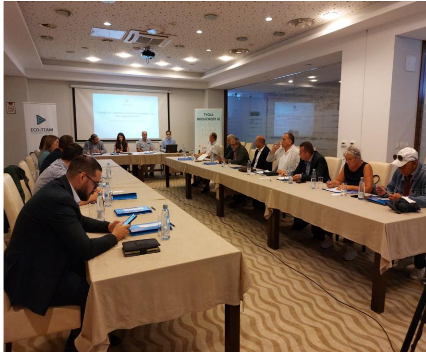
Round table "Just transition in Montenegro, where we are now and where we want to be", Pljevlja, June 2022