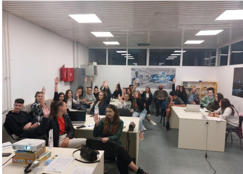
The economic and social simulation (ECOSOC), September 2022, Pljevlja