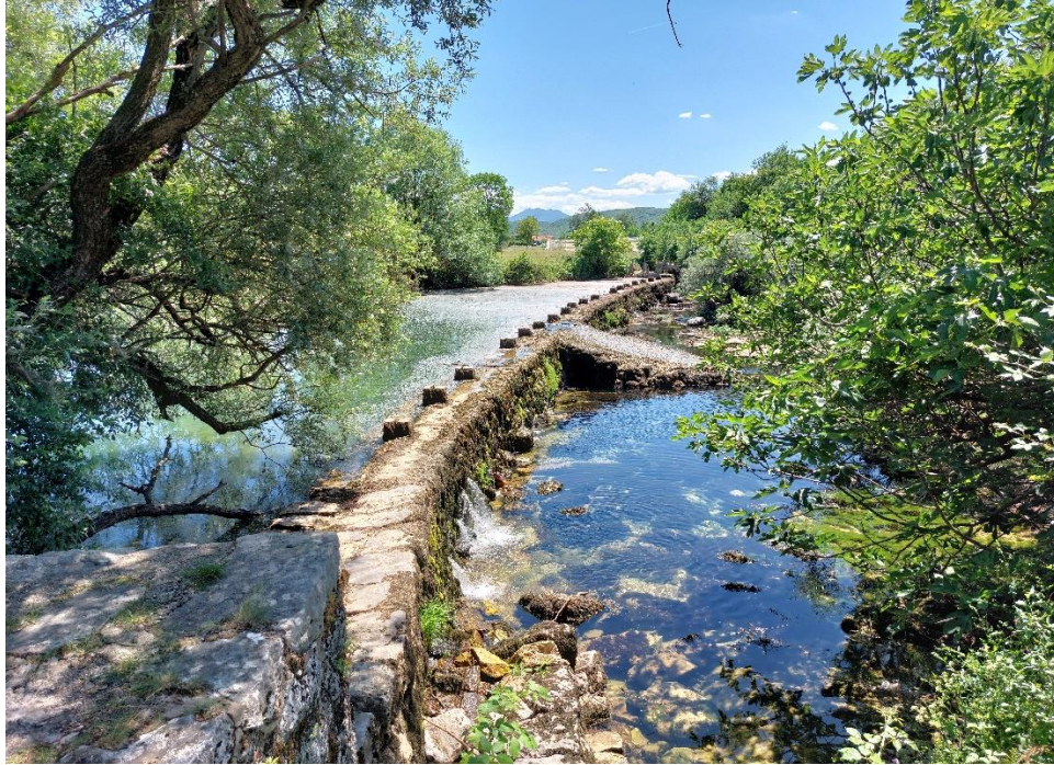
One of the barriers on the Zeta River, Nikšić, 2022.