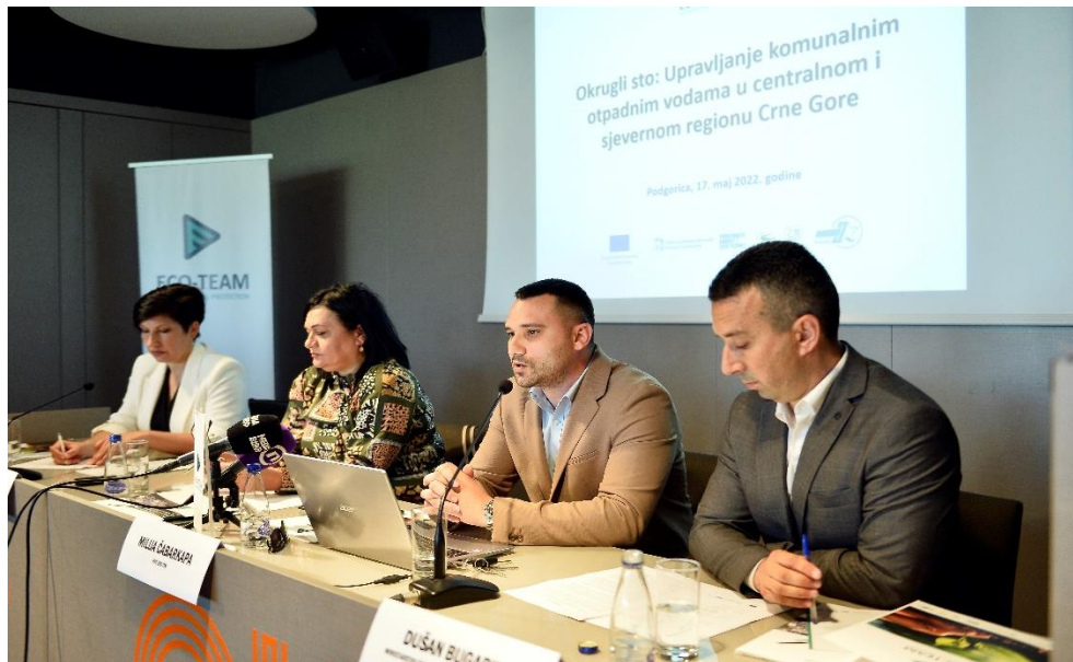
Round table, Podgorica, May 2022