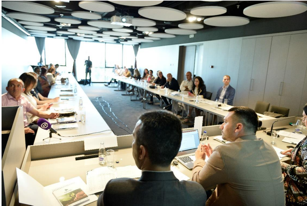
Round table, Podgorica, May 2022