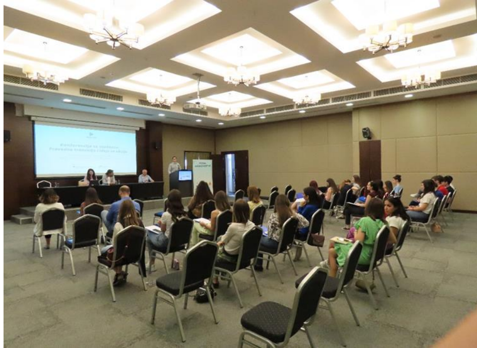
Educational conference for university students, May 2022, Podgorica