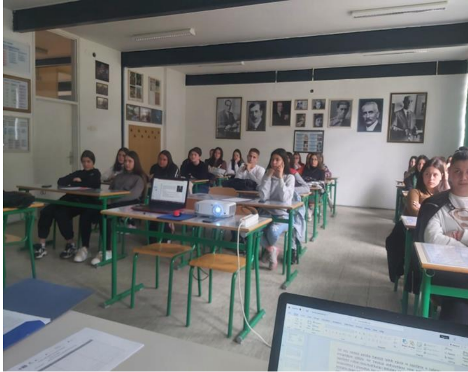
Conducting of the educational program into High professional school”, April – May, 2022, Pljevlja