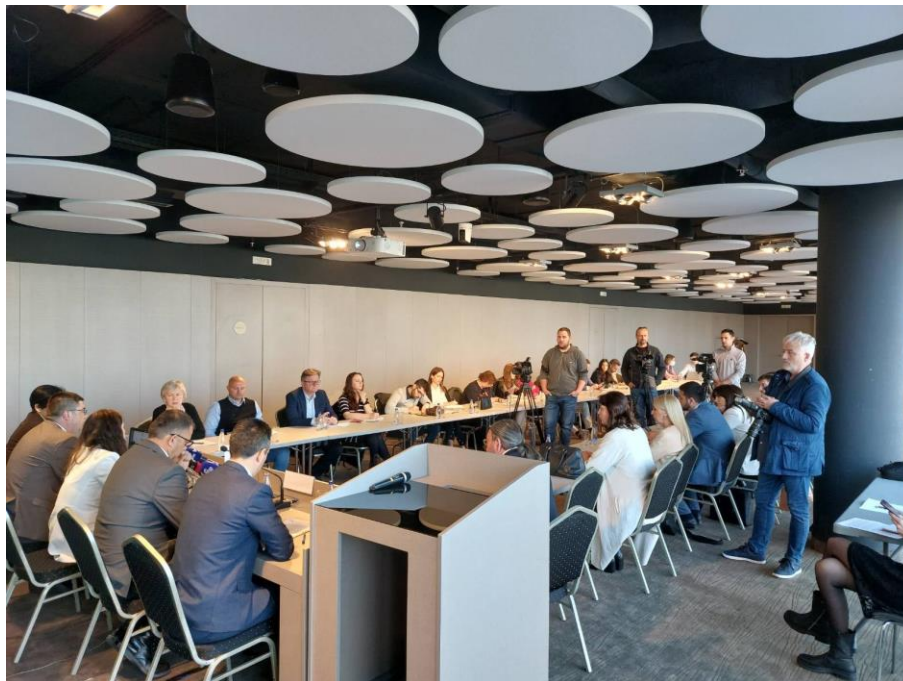
Round table "Implications of EU policy and the impact of challenges in the energy market on the energy sector in Montenegro", March 2022.