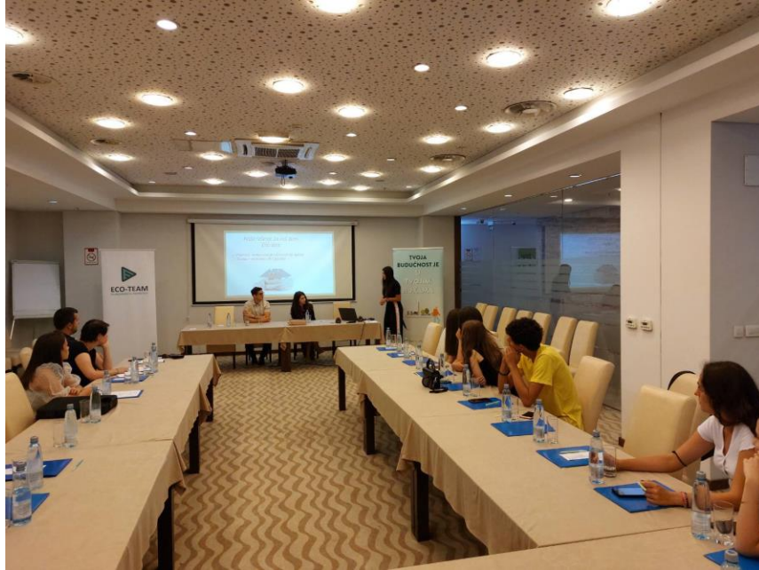
A round table "Youth, leaders of the green transition", June 2022, Pljevlja