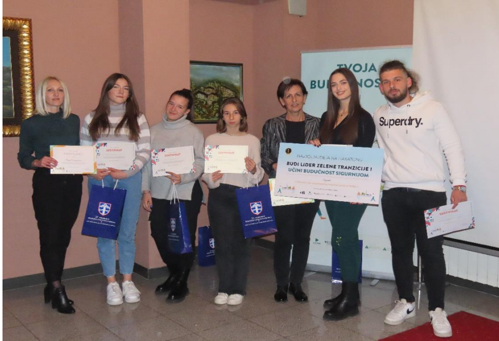
Hackathon "Be a leader of the green transition and make the future safer", November 2022, Pljevlja