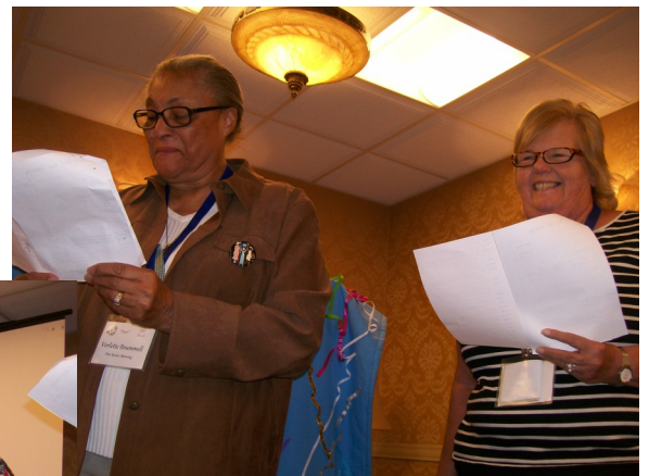
SWO Board women in action putting on a skit. Women of MANY talents!