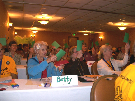
Pacifica women business session. You can tell everyone is so focused on business!