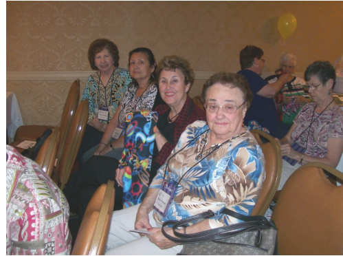
Another group of beautiful women getting ready to listen