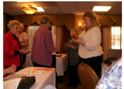
Celebrating worship and Holy Communion together.