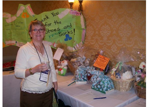
Beautiful baskets provided by our wonderful women and their units for our silent auction to support the SWO Scholarship Fund!