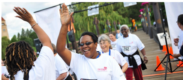
Run, Walk and Roll