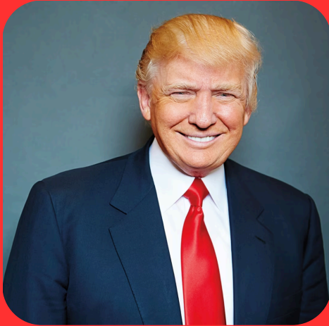
(Former President Donald Trump)