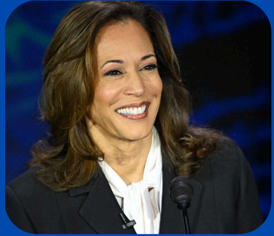
(Vice President Kamala Harris)