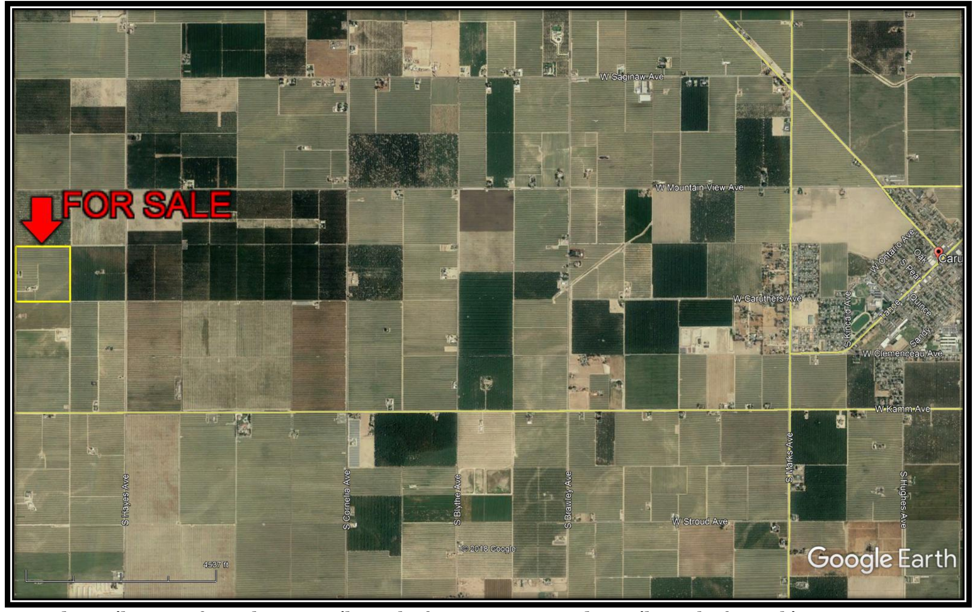
Located 6.5 miles west of Caruthers, 1.0 mile north of W. Kamm Ave., and 0.5 mile south of Mt. Whitney Ave.