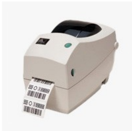
Zebra TLP-2824 plus