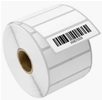
2.25" x 0.75" Direct Thermal Label -