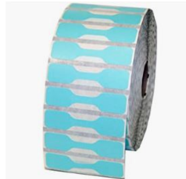
LabelValue.com | Zebra Printer Compatible 10010064 Blue Jewelry Labels - Barbell Style - 3510 Labels Per Roll