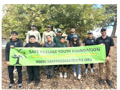
Build a Brighter Future.