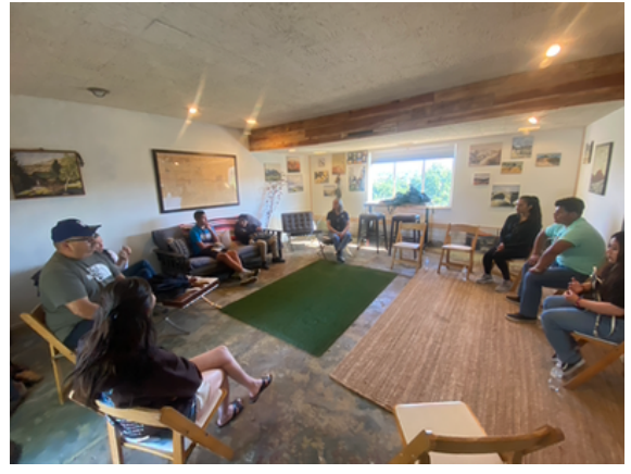
The Youth Corps has a positive impact on academic performance.