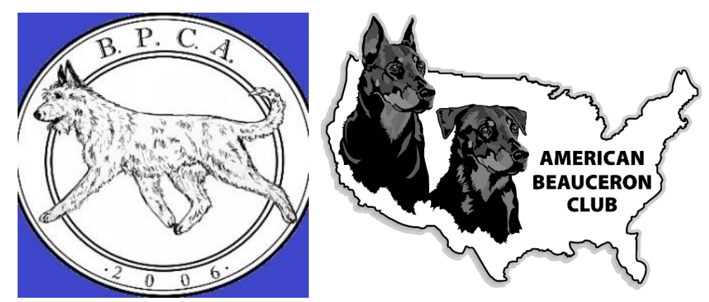
Berger Picard Club of America & American Beauceron Club Licensed by the American Kennel Club