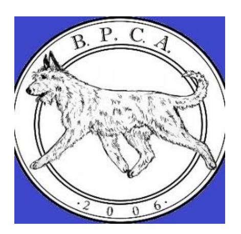
Berger Picard Club of America Licensed by the American Kennel Club

Oconee River Kennel Club Licensed by the American Kennel Club