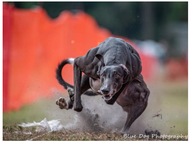
Katie Ball Beau & Arrow Images