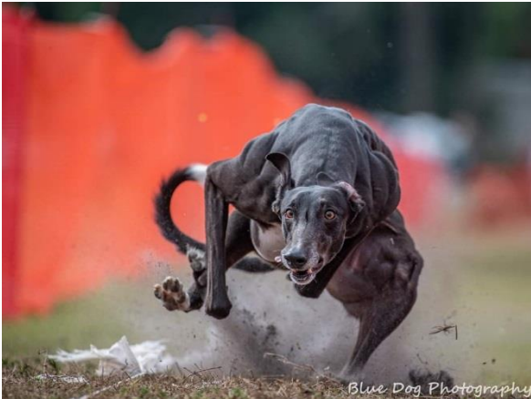
Kim Langevin Blue Dog Photography