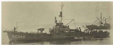
US Subchaser SC343 in Cork Harbour

Almost forgotten by history is the United States Navy's presence in Ireland. In 1914, the British entered World War I, and as part of the British Empire, so did Ireland. By 1917, the Allies were in peril of losing the war. However, in April, the United States entered the "Great War". German submarines had been causing havoc with Allied shipping, so the US quickly sent a destroyer division to Queenstown (now called Cobh, a small town located in Cork Harbor). Five destroyers were sent to Cork to destroy enemy subs with roving patrols. Later, their mission was changed to escorting