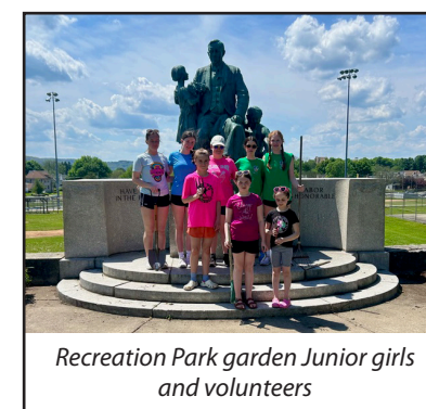
Recreation Park garden Junior girls and volunteers

We are actively recruiting new members, ages 5 to 18, for the Junior Division. We encourage our brothers and sisters to help spread the word by reaching out to eligible family and friends. As our girls age out, continued growth is essential to keeping our division strong and fostering lifelong involvement in the LAOH. For more information, please contact the LAOH 2nd Vice President or pick up an application at the Hall.