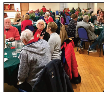
Annual Holiday Party and Pot Luck Dinner