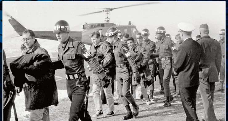
Released crewmen of the USS Pueblo are escorted by MPs upon their arrival at the U.S. Army 121st Evacuation Hospital at Ascom City, 10 miles west of Seoul, Dec. 23, 1968.