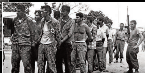
Bay of Pigs Invasion