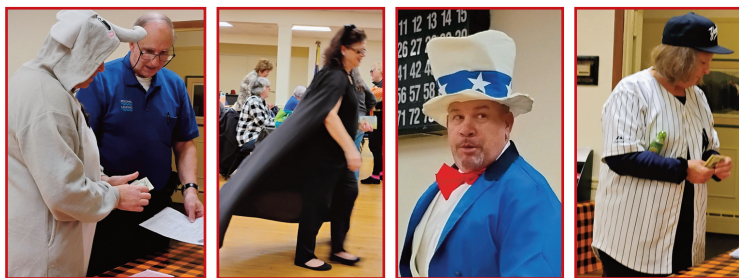
Getting into the SPIRIT at Halloween Bingo!

If the Post offered a "Card NIGHT" once or twice per month would you attend? Please respond to Ctt3@optonline.net Yes or No It could be Spades, Hearts, Poker, Pinnacle or ????