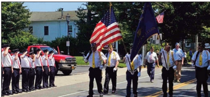
Southold Firefighters salute Members of the American Legion Post 803 marching in the 2025 Parade.

Parents enthusiastically waved to children dressed in creative costumes, marching side by side with their