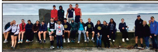
Annual Walk 4 Valor Event