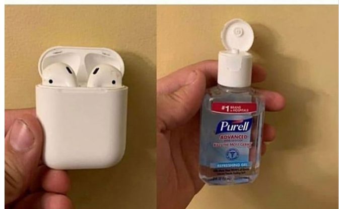
Flexing in March 2020