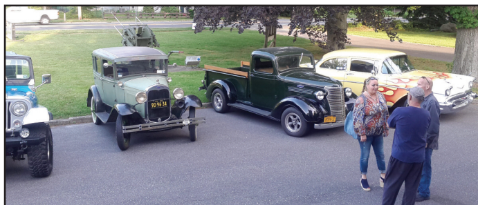
Friday evening cruise nights