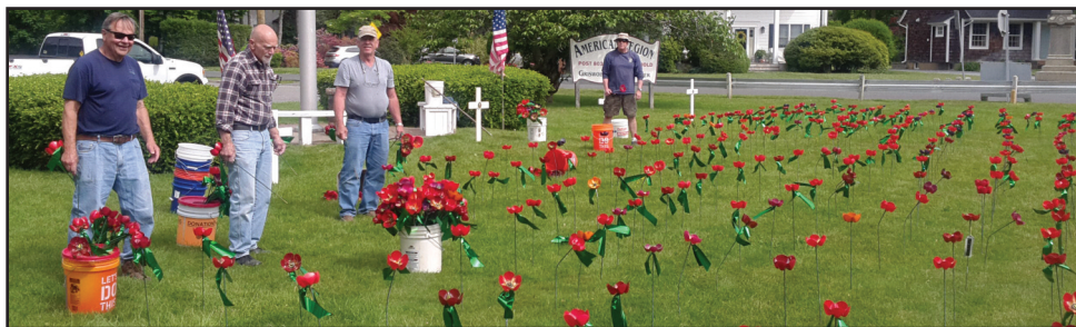
Our Poppy garden in front of the post for Memorial Day, Thank You to the Auxiliary and Volunteers