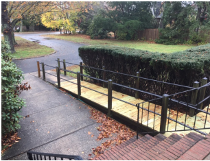
New Handicap Ramp