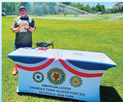
Poker Run Volunteer 10th hole. A grateful thank you, as he spent the day in the sun.