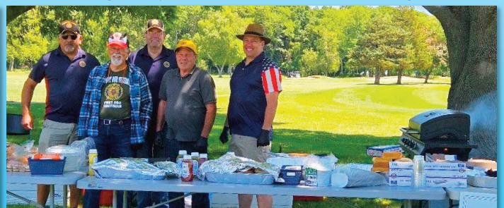
Our Grill crew.