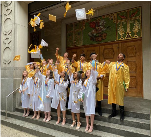
Presenting the SGA Cass of 2021 Congratulations to the Class of 2021! We are so proud of you! May God Bless You and help you to achieve your dreams!