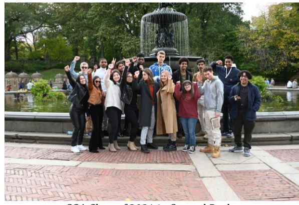
SGA Class of 2021 in Central Park