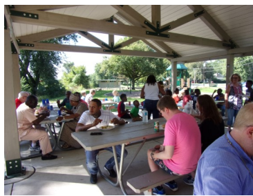
Picnic with IDOM