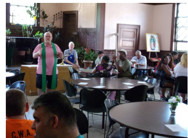
Father at Sandwich Board