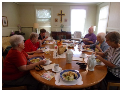
St, Margaret's Guild