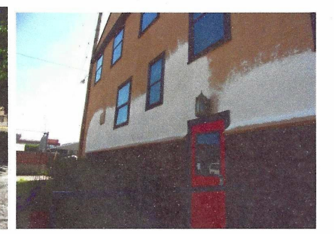
We had major stucco repair, just awaiting the paint!