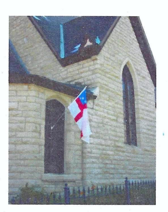
New Flags, announcing our presence to God's World and His Heavenly light shining on our processional Cross