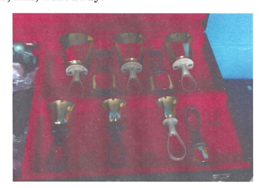
We received a huge collection of bells and are looking to form a Bell Orchestra in the fall