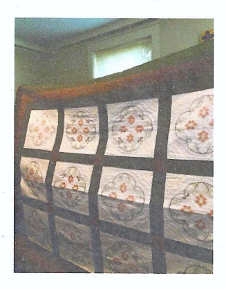
The Saint Margaret Quilt If finished and awaiting a buyer