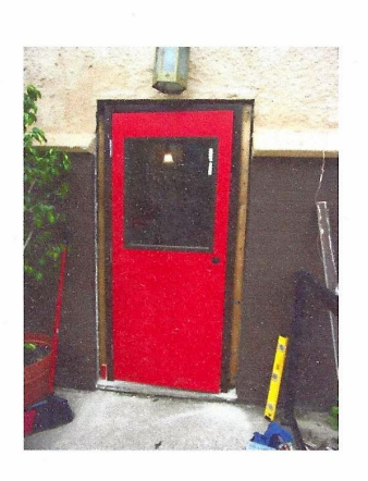
We installed a new Parking Lot door!