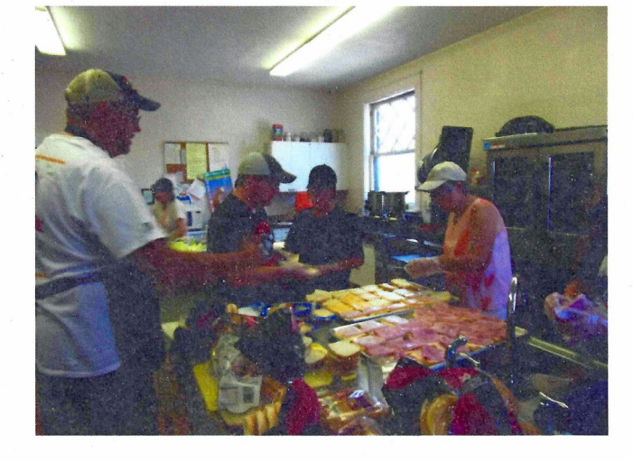
As always Thursdays bring the Sandwich Board. Trinity cooked on July 5th