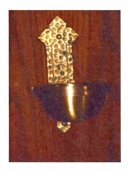
Pat upgraded our Stupe,