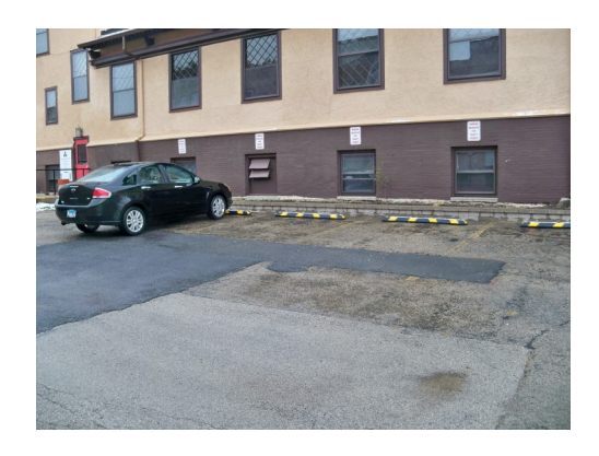
Is Finished! Pictures don't do it justice! Thank you for your Support!