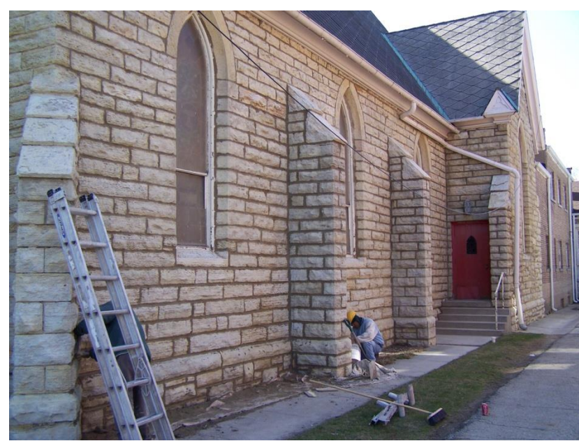
Taken during the 2008 renovation of the Church