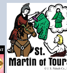
St. Martin of Tours