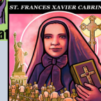
ST. FRANCES XAVIER CABRINI