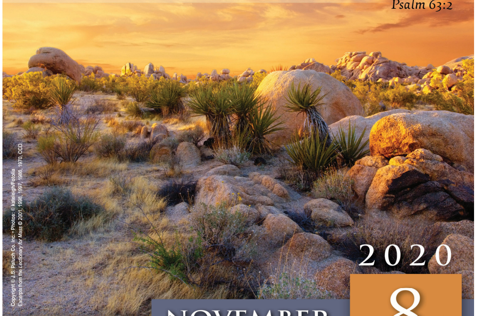
Copyright © U.S. Parish Co., Inc. Excerpt from the Lectionary for Mass © 2007, 1988, 1997, 1988, 1970, CCD.