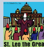
St. Leo the Great