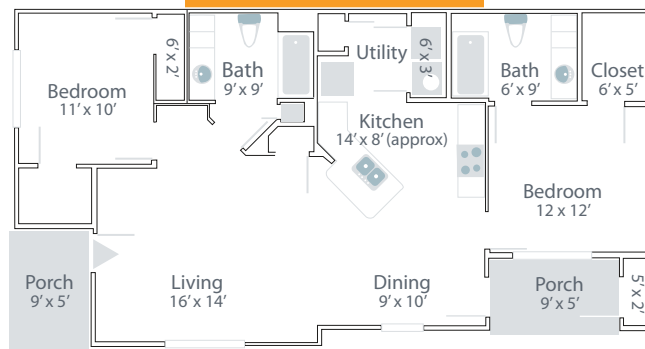
Two Bedrooms / Two Baths

We anticipate the property will be ready for occupancy in Fall of 2019. For more information, or to reserve your home please call 361-207-9880, email leasing@fishpondliving.com , or visit our website fishpondliving.com for more information.