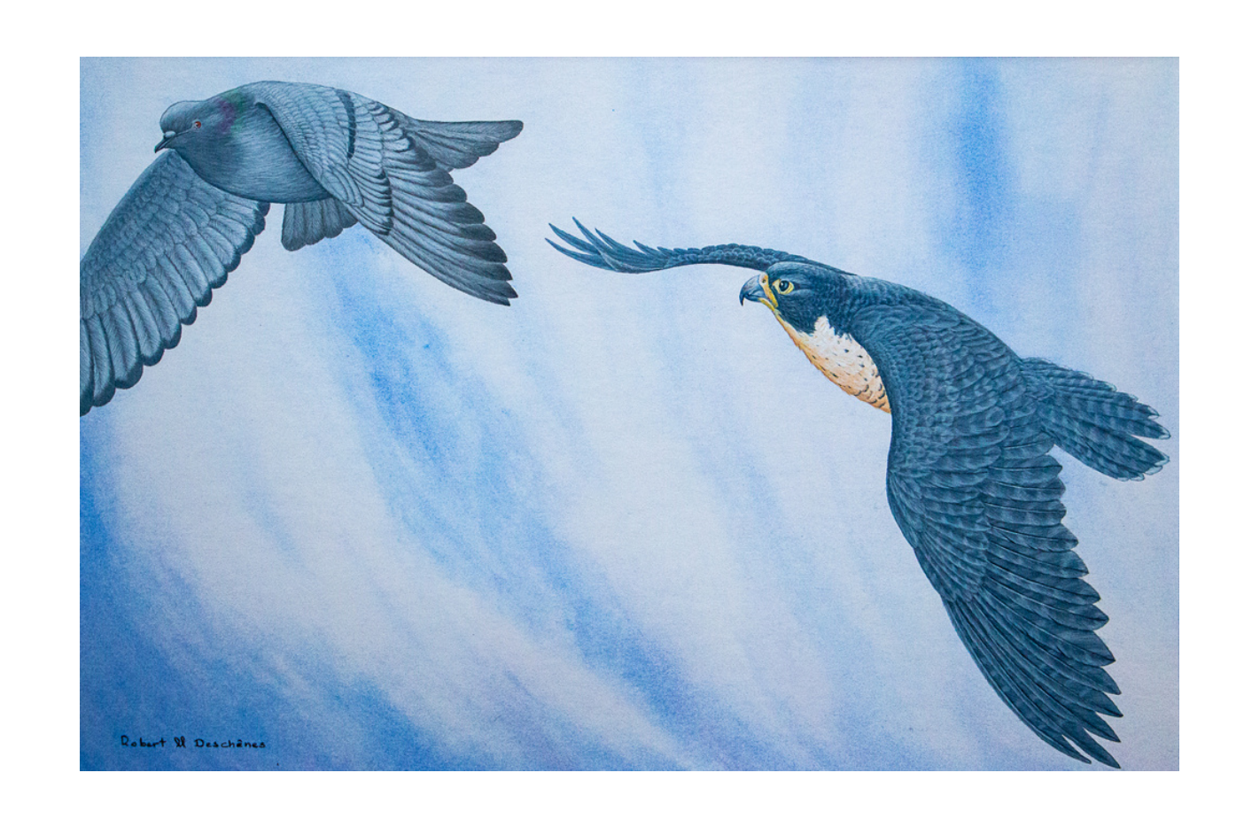
Peregrine Falcon and Rock Pigeon Acrylic 16" x 24"