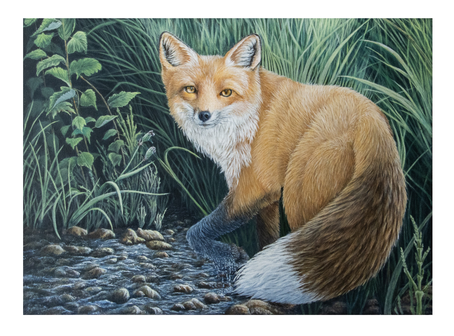
Red Fox Acrylic 13" x 18"