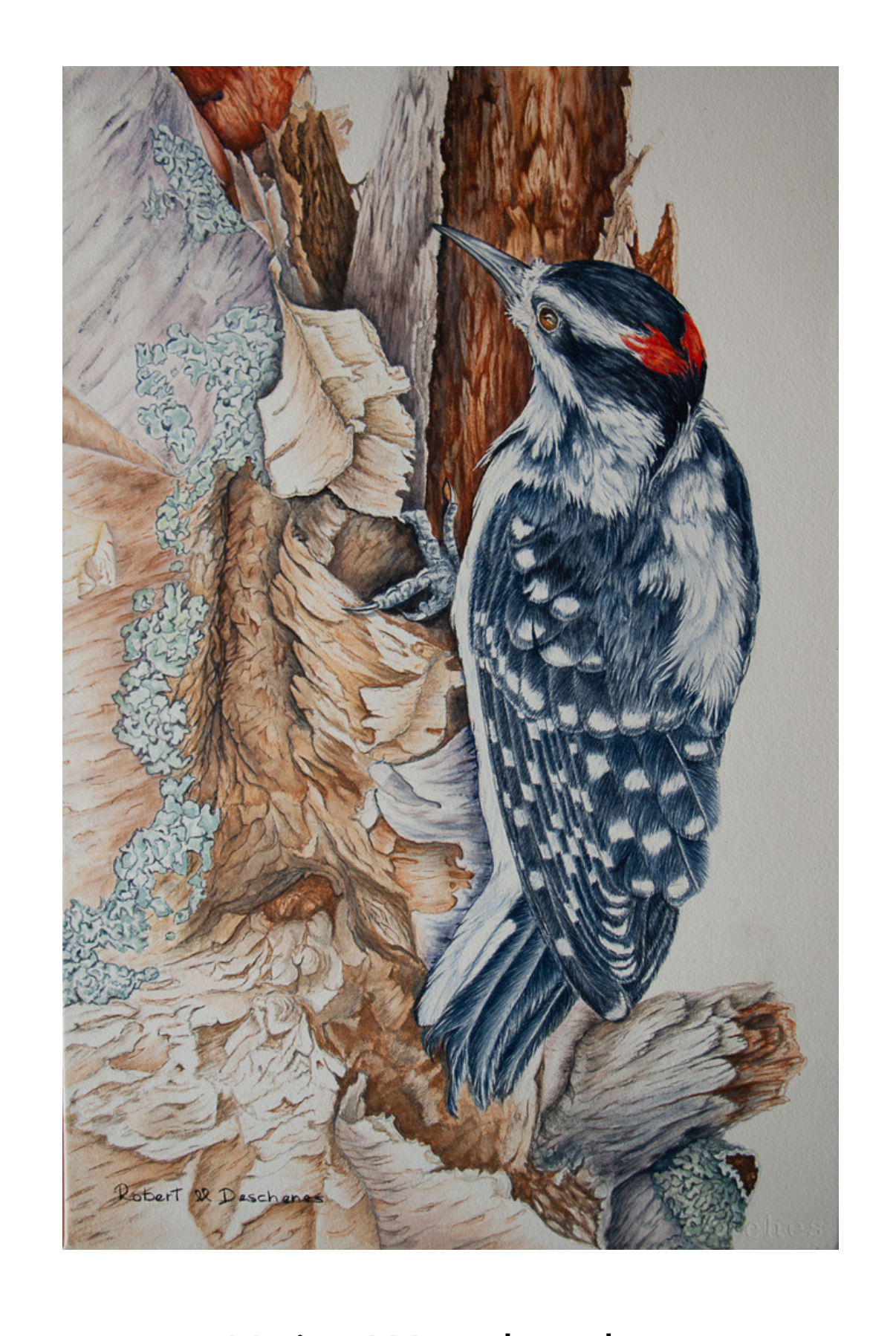
Hairy Woodpecker watercolor 13" x 20"