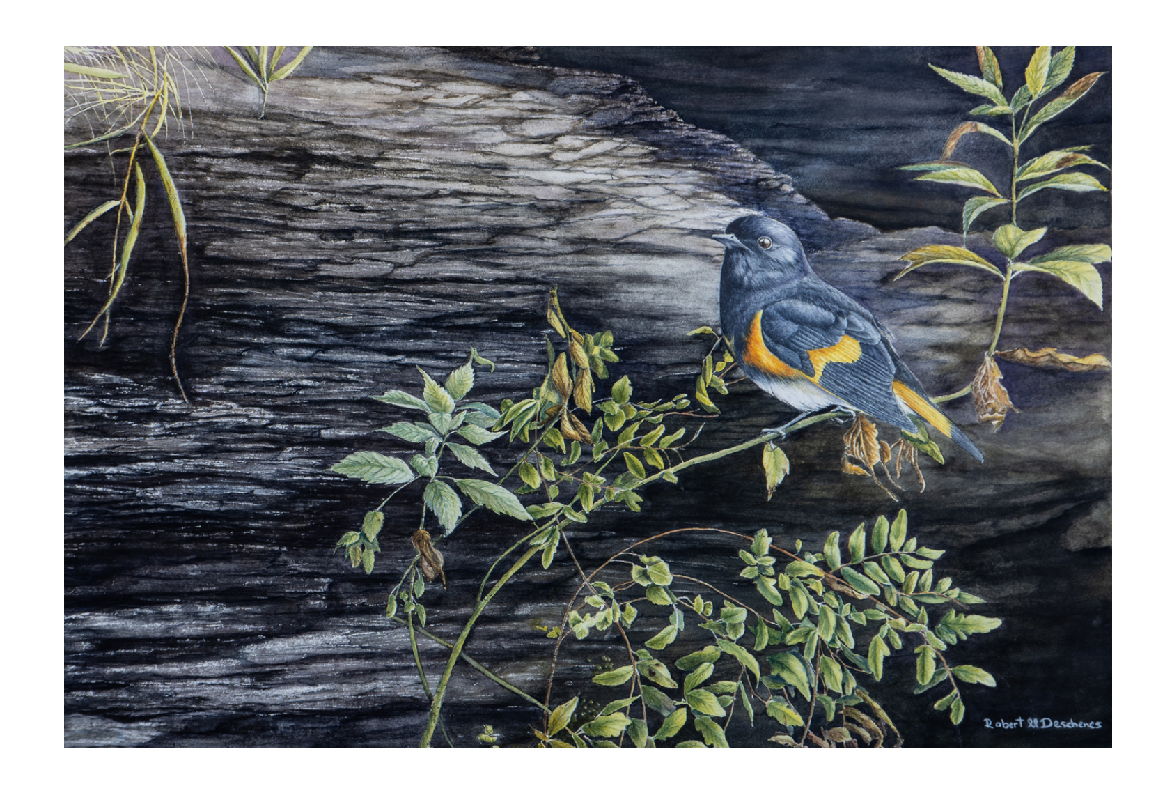
Paruline Flamboyante Aquarelle 20" x 28'