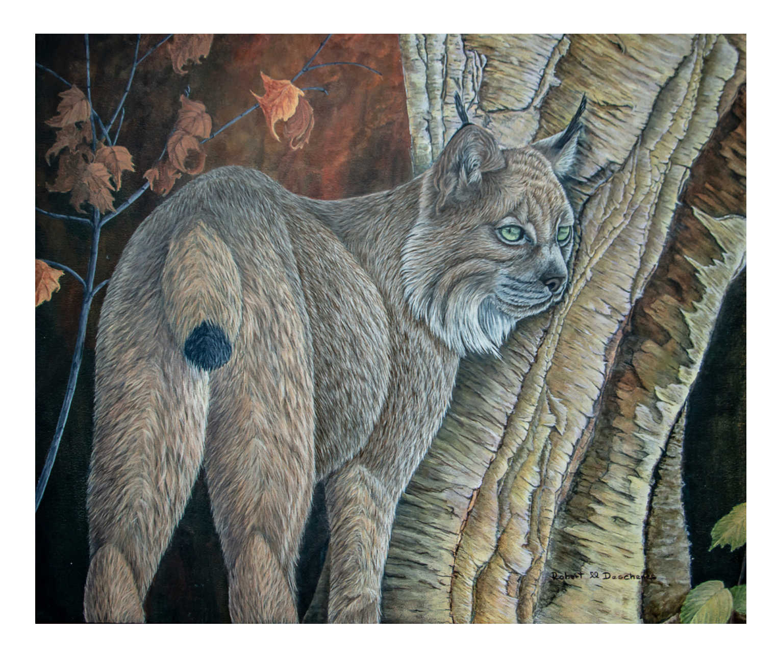
Canadian Lynx Acrylic 20" x 24"