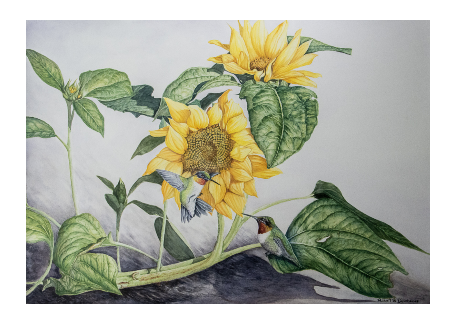
Humming Birds André Sunflowers watercolor 20" x 28"