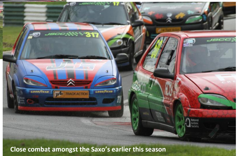
Close combat amongst the Saxo’s earlier this season