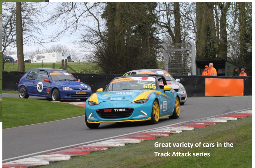
Great variety of cars in the Track Attack series