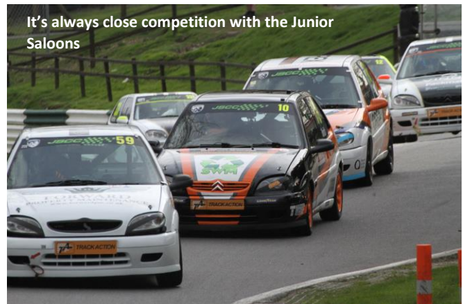
It's always close competition with the Junior Saloons

Organised by the BARC North Western Centre the CNC Heads Sports / Saloon Car Championship is now in it's 40th year. It's success very much down to an open rule book with space for anyone with a race car, provided that the car is based (however loosely) on a car originally designed for road use. The specials category is home to out and out racers, while the Modified category is cars closer to their road going roots. Each category is split into classes based on engine capacity, which means everyone has someone to compete with. The overall champion is based on points gained within your class, add to that an "It's a Knockout" (there's one for the teenagers) style joker system and it all adds up to fun competitive racing and a grid full of interest and variety and can be seen in race 2 on Saturday and Sunday's races 8 & 15.