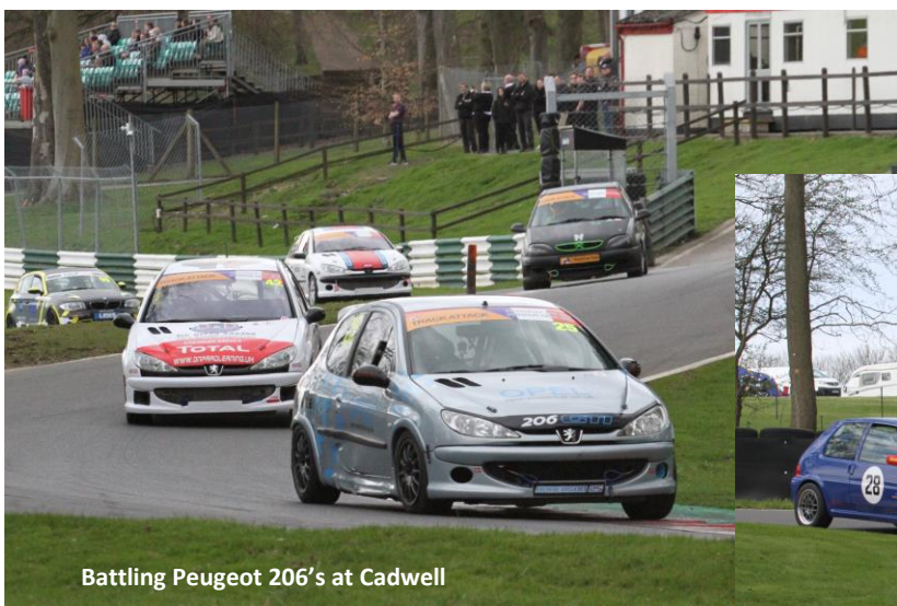
Battling Peugeot 206's at Cadwell

Dave Beecroft said it's wonderful to see affordable racing at a great level and with the drivers getting out with big smiles as they have good clean racing going on through the field.