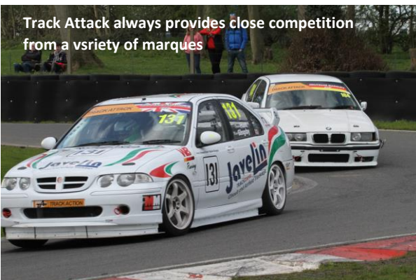
Track Attack always provides close competition from a variety of marques

What do you get when you mix the 206 GTi Cup, Deutsche Marque Cup, Nippon Challenge, Tricolore Trophy and TT Trophy together? Is great racing and a cost-effective way to get into motorsport, oh and it's called the Track Attack Race Club. They close proceedings with the last race on Saturday and race 13 on Sunday.