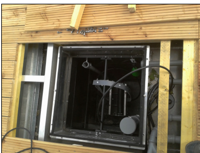
Tank 2: Membrane stage in the portside-floating body