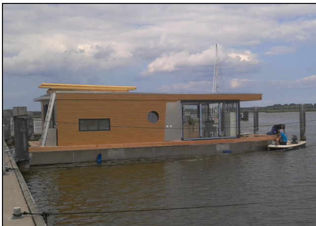
Exterior view of the floating home at the marina Kröslin