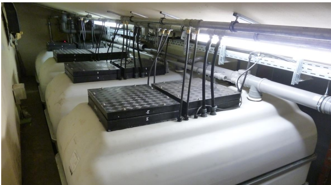
4 MBR tanks each with 5000 liters of volume installed in the technical room of the hotel