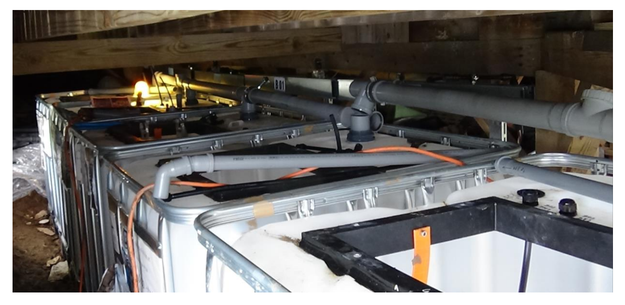
BUSSE-system installed accurately fitting below the terrace of the house.