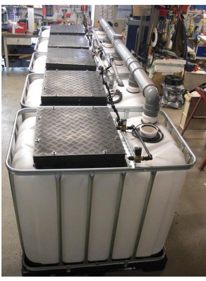
BUSSE-system in a special adaption for low installation sites.