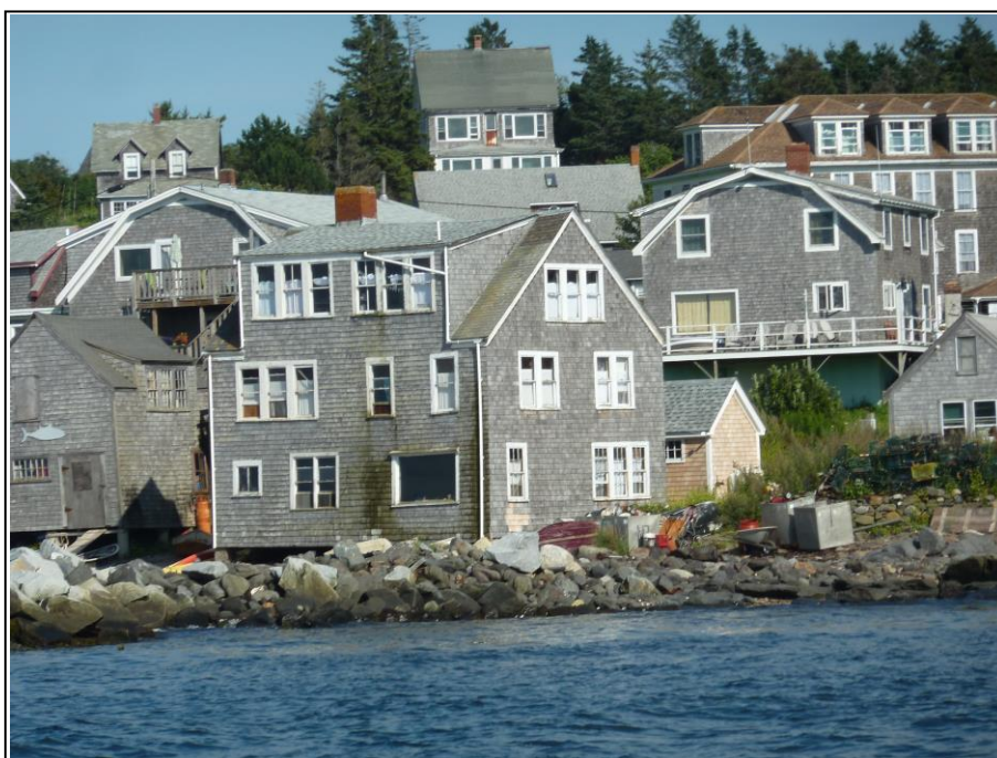
Exterior view of the Vacation Home