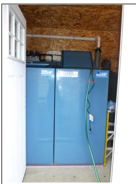
Installation of the BUSSE-MF in the shed