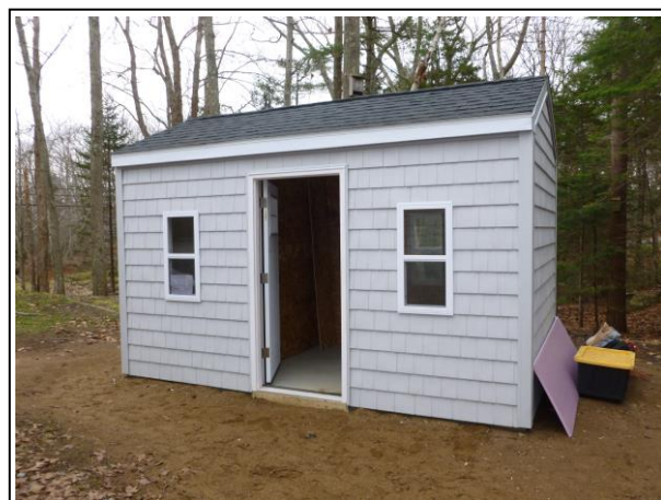
Vacation home with the Installation room