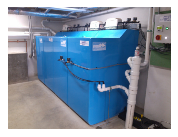
Installation of the \ensuremath{\mathsf{BUSSE}\text{-MF}} in the basement of the house