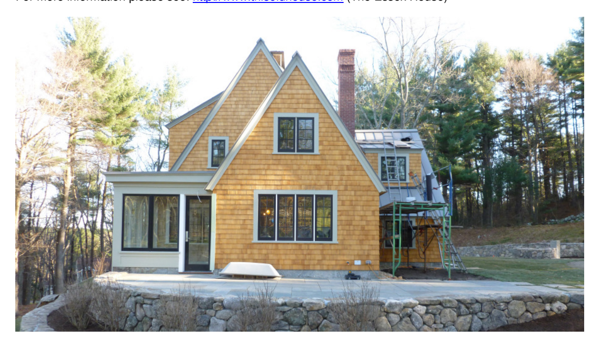
Exterior view of the Essex House of the US-TV-Show "This Old House"

"This Old House" is an American home improvement magazine and television series. "Old houses" are being remodeled over a number of weeks. They become true gems with modern design and sophisticated technical solutions. In the "Essex House" for instance a BUSSE-MF has been applied. For more information please see: <a href="http://www.thisoldhouse.com">http://www.thisoldhouse.com</a> (The Essex House)