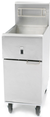
SR14E Shown with optional casters.