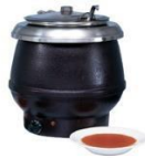
8-12Qt Soup Kettles