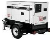
20Kw-200Kw Standard Generators