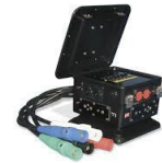
Power Distribution Panels