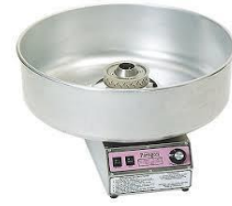
Cotton Candy Machine