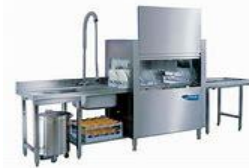
Conveyer/Rack Dishwasher 4' Soil & Clean Table 200RPH 208v 200A