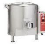
20-40G Kettles Tilting / Steam Jacket LP 120,000BTUs Electric 208v 30-60A