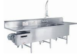
3 Basin Pot Sink W/Wash wand & Faucet