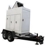
175Kw Generator Studio Crawfords 60Kw-200Kw