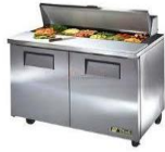
1-2 Door Refrigerated Prep Station 110v 20A