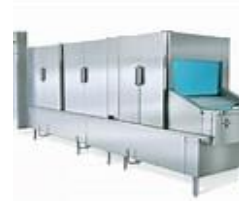
Flight Dishwasher 19,000 Dishes Per Hour 208v 400Amp Skid Mounted or in Trailer