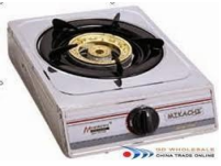
1 Burner LP