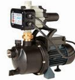
3/4" Fresh Water Pump & System