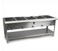
5 Well Steam Table Sneeze Guard Tray Slide 208v/240v 30A