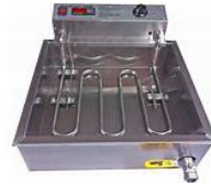
Funnel Cake Fryer