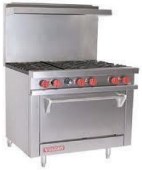
4 & 6 Burner Ranges W/Oven LP 250,000BTUs Electric 208v 50A