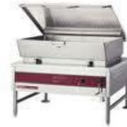
30 & 40G Tilt Skillets LP 120,000BTUs Electric 208v 50A