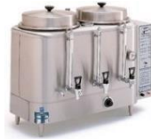
Twin 3-5G Coffee/Hot Water 208v 50A