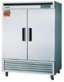
1-3 Door Reach in Refrigerator/Freezer Units 110v 20A