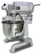
20-60Qt Mixers 240v30A-60A W/ 3 Attachments