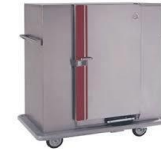
Banquet Cart 80-160 Plate