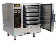
AccuTemp Steamers Single or Double 240/208v 30A