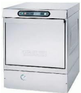
UnderCounter Dishwasher Low & Hi Temp 110v 30A & 240v 30A 25 RPH