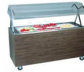
Refrigerated Buffet Tables 4' with Guard