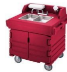
Portable Self Contained Hand sink 110v 20A