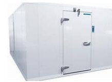
8'x10' Walk In 8'x20' Walk In Refrigerator or Freezer 240v 30A