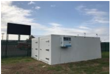
Modular Walk in Units Custom sizes in 4' Incr. Refrigerator or Freezer 240v 50A x 2