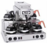
Coffee Maker with warmer