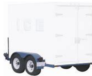
6'x8' Refrigerated 6'x12' Refrigerated Trailers 110v 20A/240v 30A