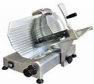
Slicer 1/3 HP Manual / Automatic 110v 20A