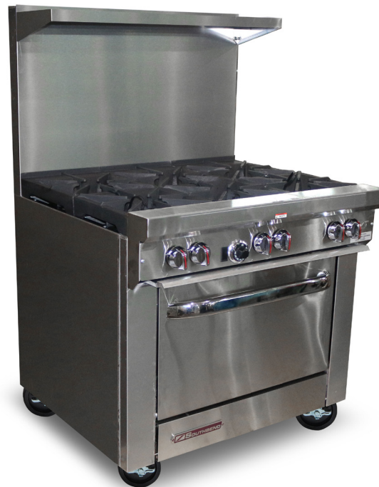
(S36D shown with optional casters)