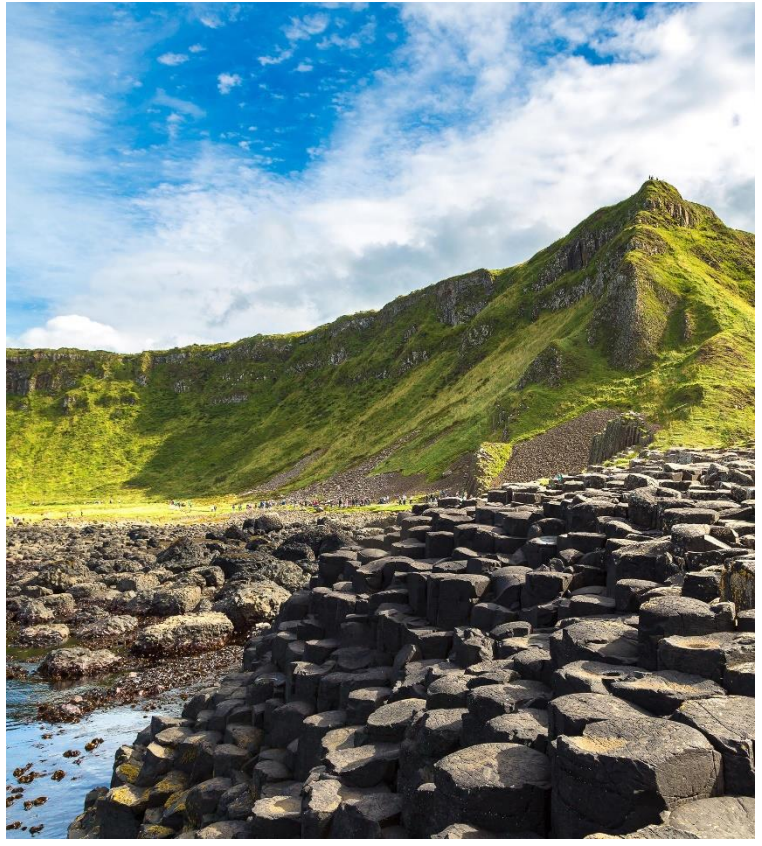
13 Days • 19 Meals: 11 Breakfasts, 1 Lunch, 7 Dinners

HIGHLIGHTS... Edinburgh, Edinburgh Castle, Royal Edinburgh Military Tattoo, St. Andrews, Loch Ness Cruise, Urquhart Castle, Distillery Visit, Glasgow, Belfast, Giant's Causeway, Sheepdog Demonstration, Cider Farm Tour, Dublin