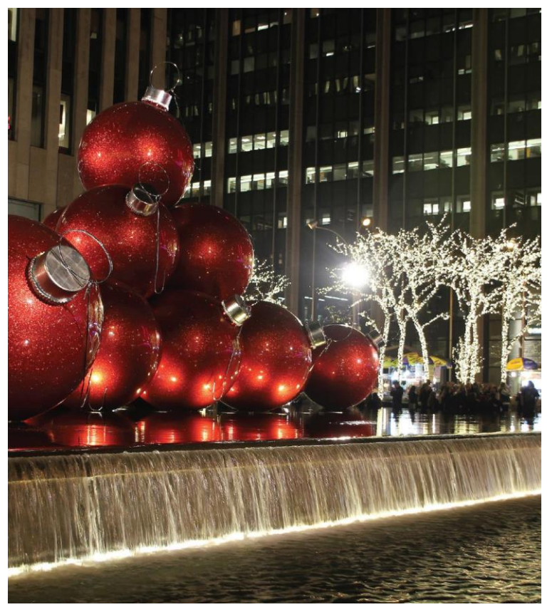
5 Days • 5 Meals: 3 Breakfasts, 2 Dinners

HIGHLIGHTS... Greenwich Village, Wall Street, Christmas Spectacular at Radio City Music Hall, Statue of Liberty, Ellis Island, 9/11 Memorial, 9/11 Museum, Broadway Show